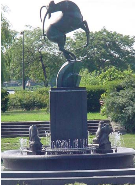
Levi Barbour Fountain

SUPPORTING THE ANNA SCRIPPS WHITCOMB CONSERVATORY AND GARDENS