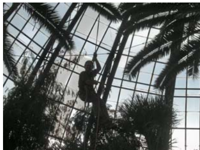
Steve Turner in the Palms

2009: And then there was light! BIBS funds Arboricultural Services to perform the first palm pruning with glorious results. The Grosse Pointe Farm and Garden sponsor Step into the Gardens in the fall to fund repairs to the stairways in the garden.