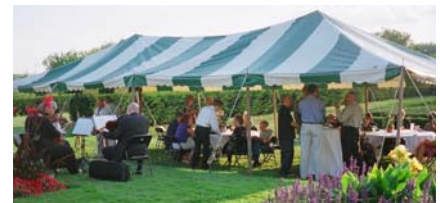
Guests under the tent at Step Into the Gardens , 2009

And so, a brief summing up of 23 years of BIBS history. We'll soon be part of the Conservancy but still striving to