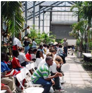
Science Lab students

2001: BIBS begins participating in Friends of Belle Isle's annual February funfest, Shiver on the River . BIBS awarded Adopt-a-Park sign for the Conservatory.