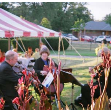
Musicians at A Step Back in Time