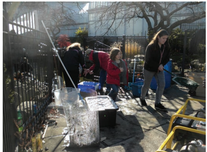
Volunteers come in all ages