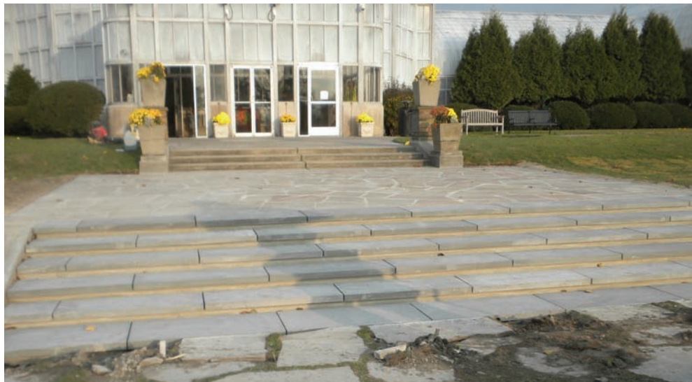
Patio on new cement base with new bluestone steps