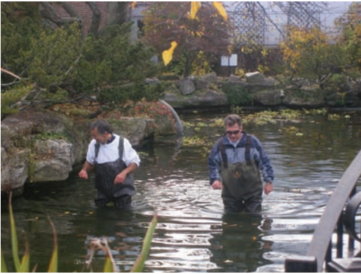
The hunt begins

Friends of the Belle Isle Aquarium transferring the Koi inside for the winter