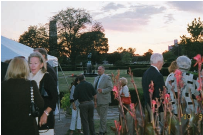
More than 400 guests enjoyed a great evening