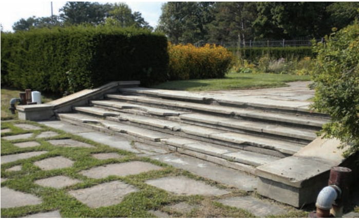
Perennial garden steps