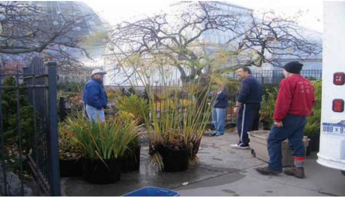
Moving the pond plants