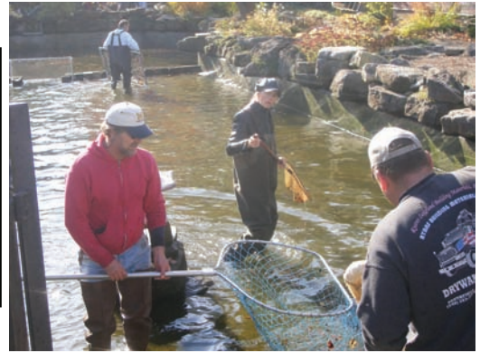
Getting out the nets

Friends of the Belle Isle Aquarium transferring the Koi inside for the winter