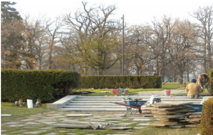
Mortaring in the new bluestone steps

Thanks to the fundraising efforts of The Grosse Pointe Farm & Garden Club and The Grosse Pointe Garden Club