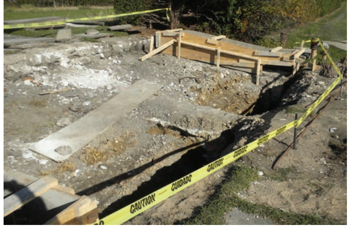
Perennial garden steps demolition