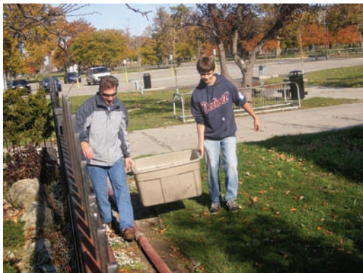
Moving back inside

The Koi are housed in the Conservatory/Aquarium basement and cared for by FOBIA volunteers until spring sunshine warms up the pond again.