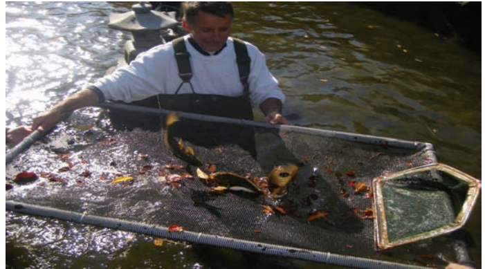
Capturing the fish