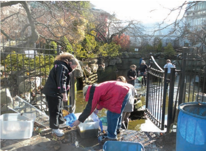
Transporting the Koi